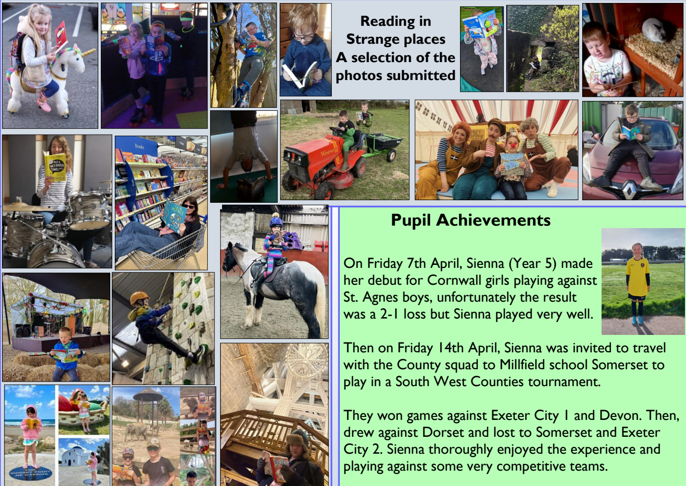
Reading in Strange places A selection of the photos submitted