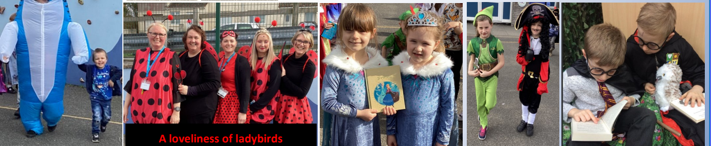
A loveliness of ladybirds

Are you sitting comfortably..... then I will begin. Once upon a time in a land far, far away there was an amazing group of children known as Year Two. They spent their days doing as they were asked straight away, trying their best, being kind and gentle, moving sensibly and taking good care of their school. One day a special day arrived known as world book day and everything seemed a little bit different but strangely the same. There were wizards, princesses, genies, footballers and pirates where the children once were and smiles and laughter as cats could talk and people could fly some other interesting characters even joined them to share books (Year Four) but just like that in a puff of smoke the day was gone..... until next year.